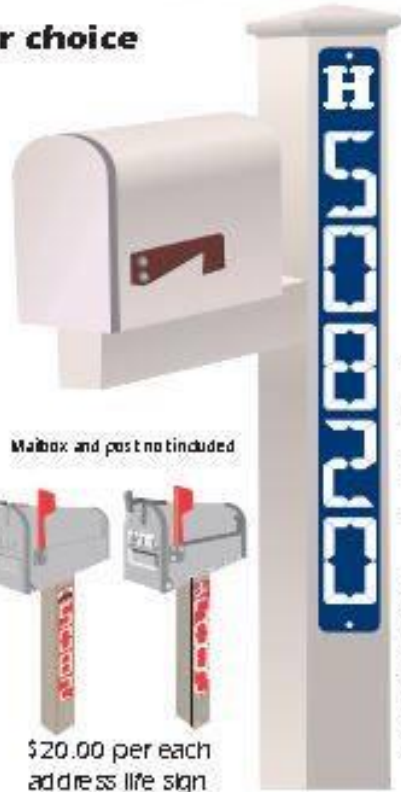
Mailbox and post not included

• All-In-One Stick 'n Peel Number™ reflects up to 100 feet away with Night Vision Numbers